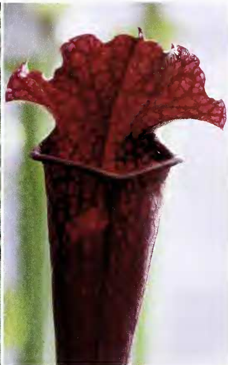
Figure 1: Sarracenia 'Katerina'.